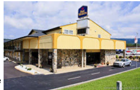
Best Western, Dayton, TN

The official motel is the Best Western Inn, 7835 Rhea County Highway (US 27 North), Dayton, TN. A total of 12 rooms have been blocked out with the hotel and will be held until the Wednesday before the test. If you want to stay at this Inn, contact the Best Western directly and tell them that you are coming for the ETRC Hunt test in order to get the special rate. The phone number is (423) 775-6560.