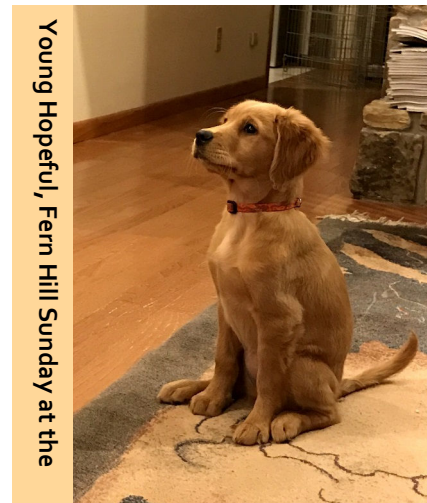
Young Hopeful, Fern Hill Sunday at the