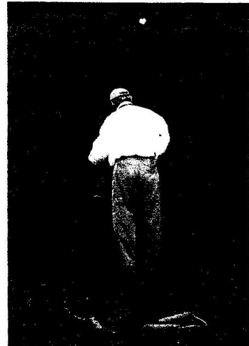
BB blinds provide repetition for working on a variety of problems, and the presence of the assistant in the field may help to get the dog focused out in the field.

At some point, the handler directs the assistant to walk toward the left after dropping the bumper. In this manner the assistant retraces his steps back toward the starting point. There is no set formula for how many bumpers