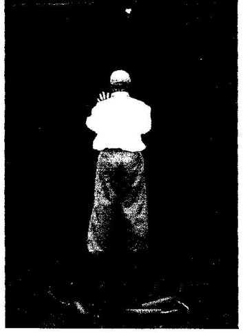
BB blinds can be used to teach and enforce a prompt and straight "sit" in a field situation. Using a combination of attrition, praise, and occasional correction, you can improve your dog's response to the whistle.