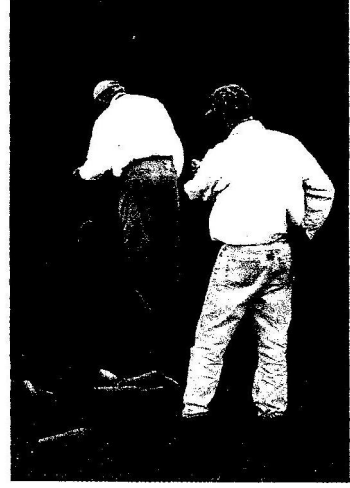
BB blinds also provide practice for lining up your dog. Here, the handler gets some coaching as he prepares to send the dog.