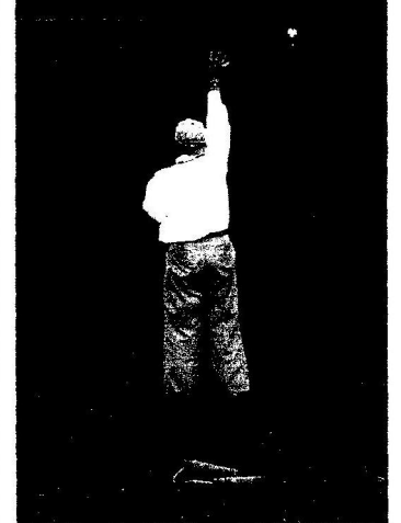
A literal casting standard makes the BB blinds most effective for advanced retrievers. Consequently, most of your casts will be straight or angle "back."