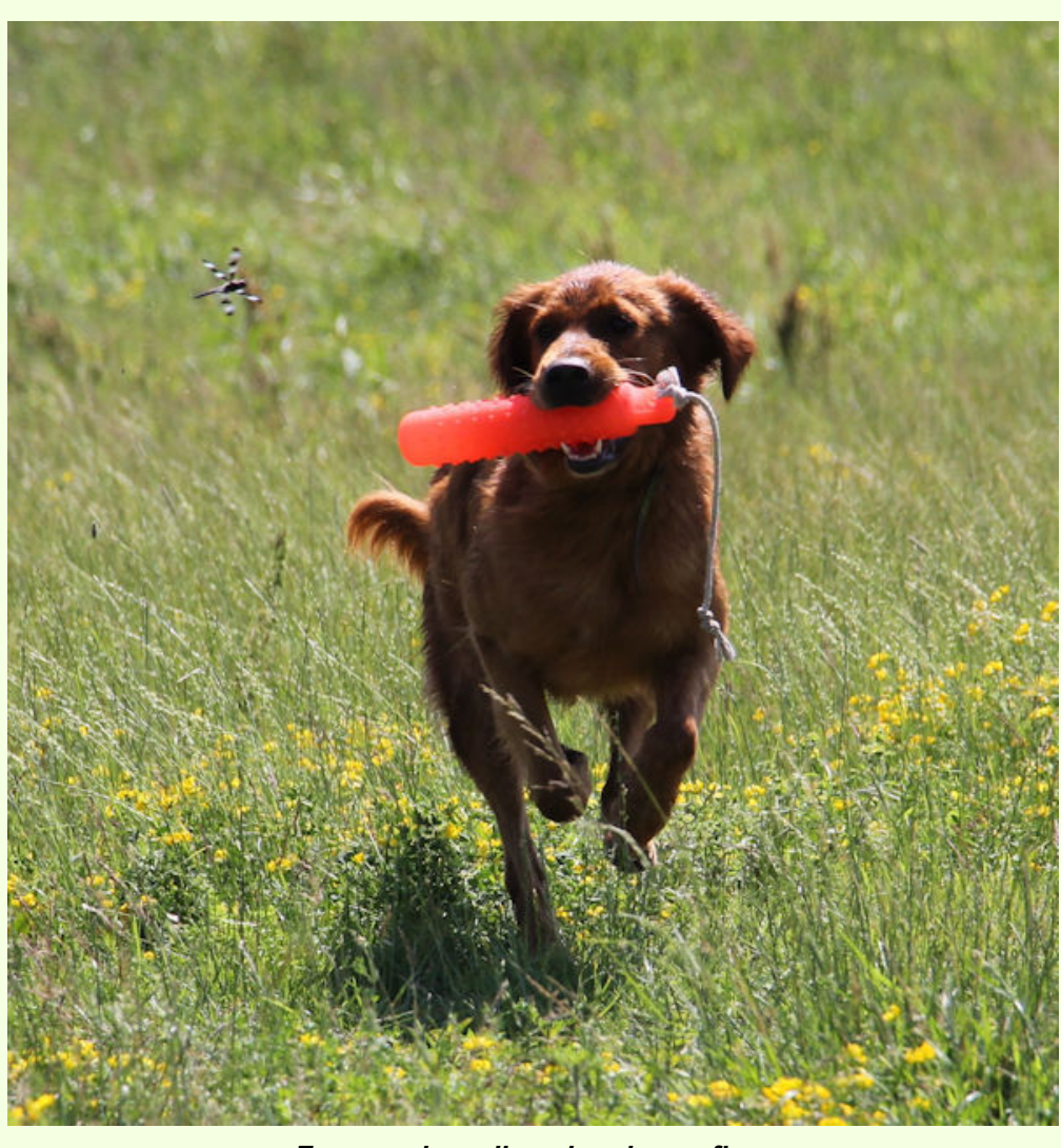
Zoey marks a diversion dragonfly....