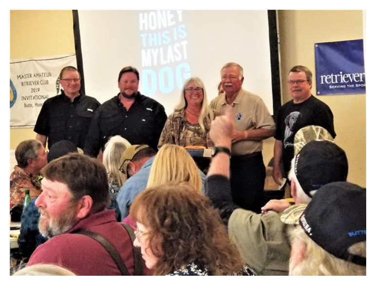
More pictures from the 2019 Master Amateur