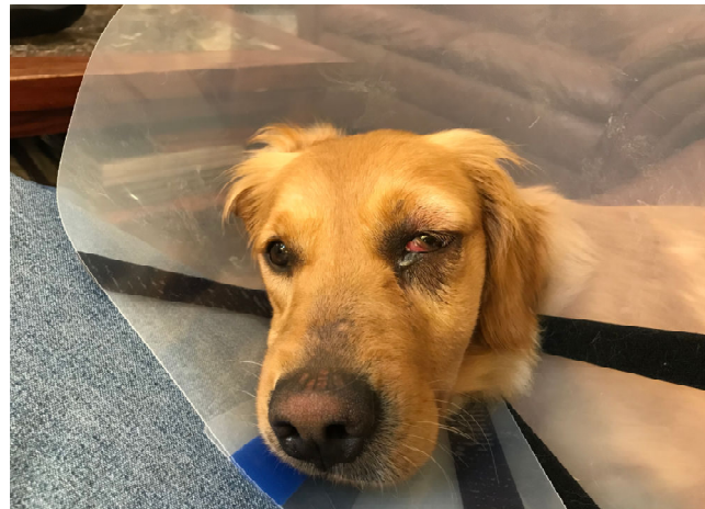
Py, the evening before diagnosis — showing almost all symptoms to the left except for foul breath and nasal discharge.