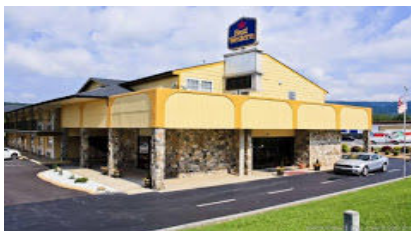
Best Western, Dayton, TN

Hope to see you there, as a competitor or worker or both!