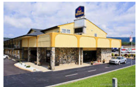
Best Western, Dayton, TN