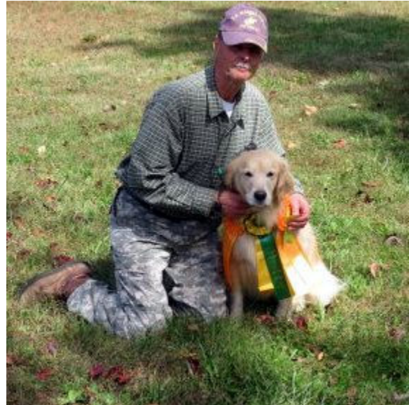
New Junior Hunters —