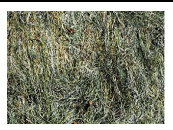
4 Ghillie blankets, 5x9. 3 are unopened, the 4th only used once. These are used as blinds for hunting or field trials. Cost $100 each new on Amazon, $50 each.