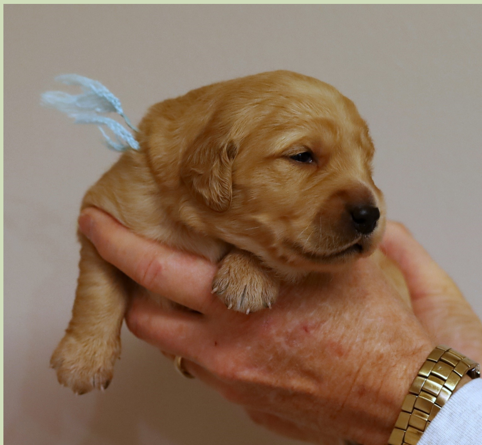
Is there anything cuter than retriever puppies?