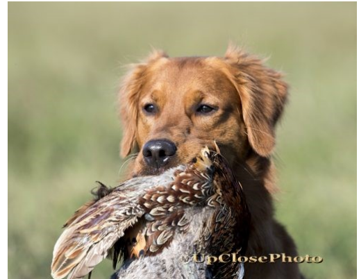
Py is on the left; two pictures of Topper in the middle and on the right.