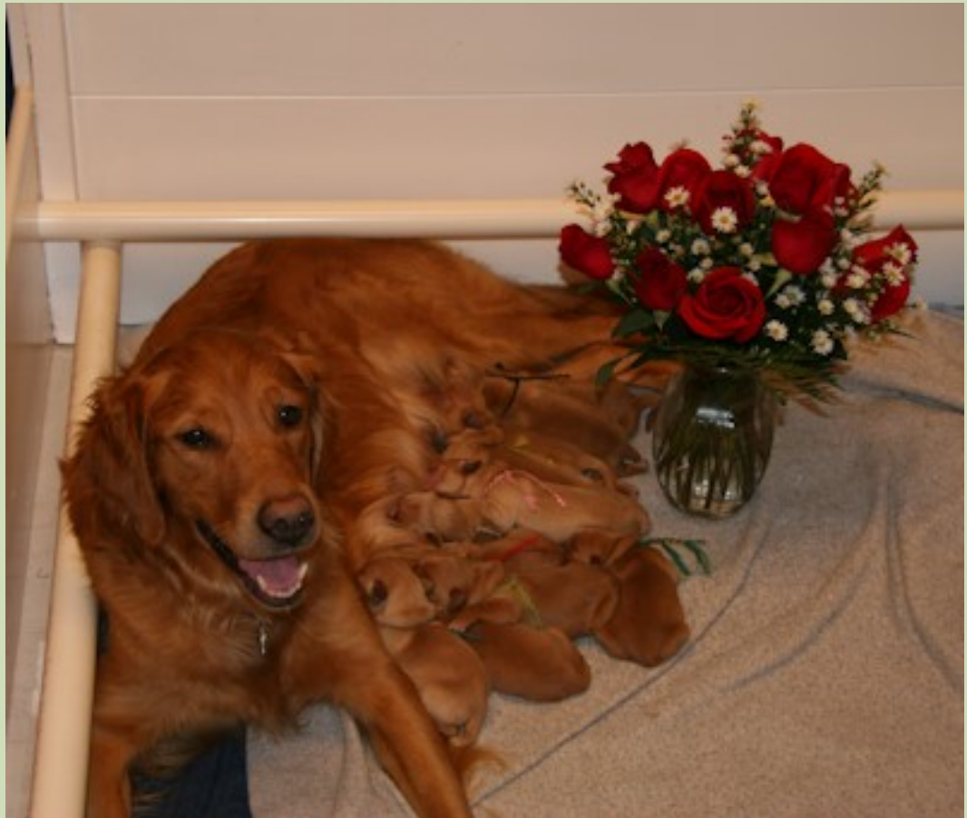
Happy Labor Day, Y'all!