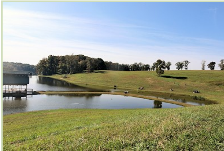
Big pond and part of pavilion at Lucky 7

We may not have the usual pressure and competition for Master entries, given that the UKC Grand is going to be held that same weekend at Poole's Knob over near Nashville. It seems like every year our big spring and fall hunt tests conflict with some national event! However, a total of 35% of the Master entries will be reserved for Amateur early entries; spaces not filled will be open for everyone the next day. Judges have been selected and approved, and the premium is up on Entry Express. The test will open Tuesday, September 27 at 7:00 pm CENTRAL TIME, for amateurs and anyone with Worker Codes. It will open up for everyone on Wednesday, September 28 at 7:00 p.m. Central Time. Closing date is Monday, October 10 at 1 second before midnight. Entry fees are $80, $90, and $100 for Junior / Senior / Master.