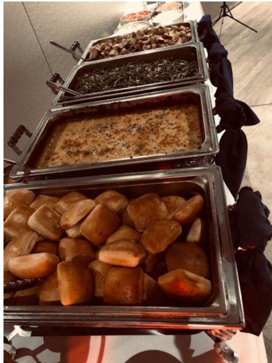
Banquet Pictures from 2022