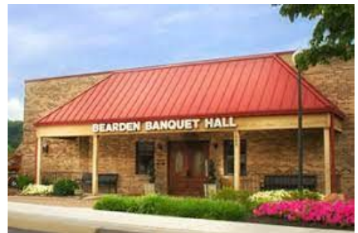
Banquet hall, above