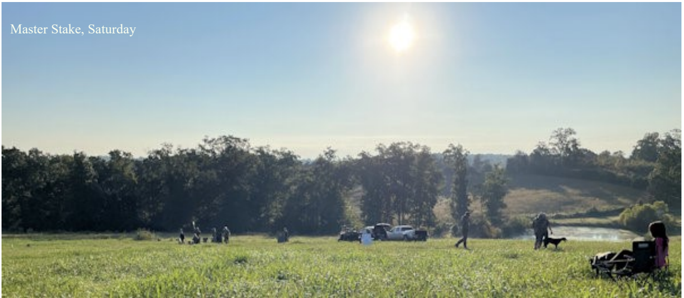
Master Stake, Saturday

We had a small test, which is bad in the sense that we didn't quite break even, but was good for being relaxed and much more fun for everyone. Of the dogs participating, Here are the results: