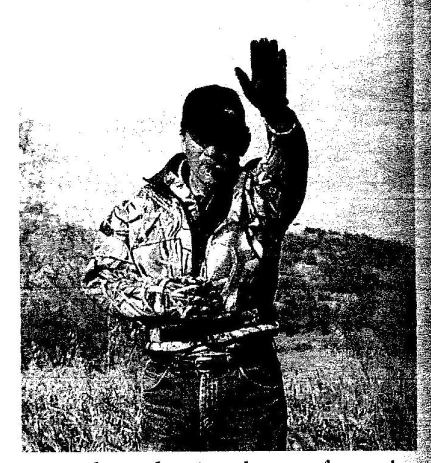
Notice how slanting the arm forward decreases the visibility of the hand signal.