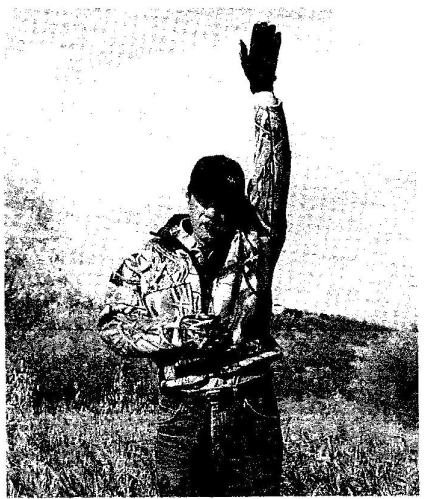
When giving a "back" cast, extend your arm straight up.