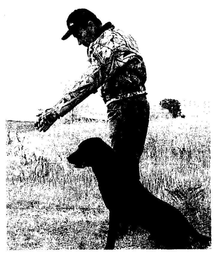
When sending the dog for a blind retrieve, position your hand high enough over his head so that he doesn't have to duck under it when leaving your side.