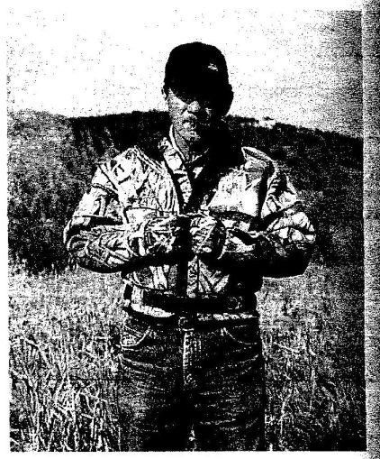
As soon as your dog leaves your side, get ready to handle: whistle in your mouth; hands together in front of your chest.