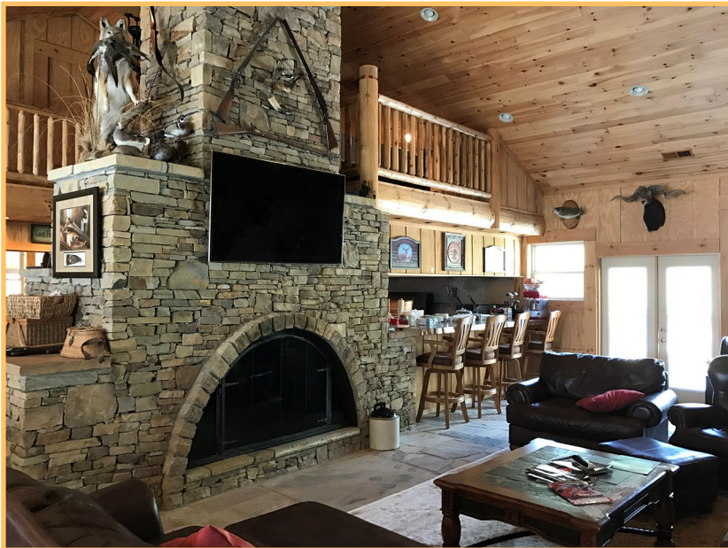
Clubhouse where we held the Judge's Dinner