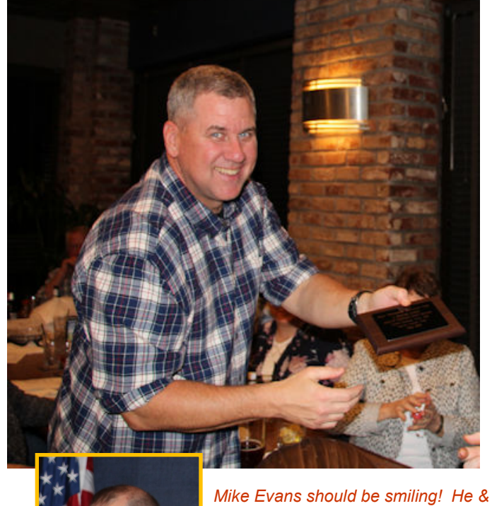
Ivy earned SH & MH title awards and the Gun Dog of the Year award!